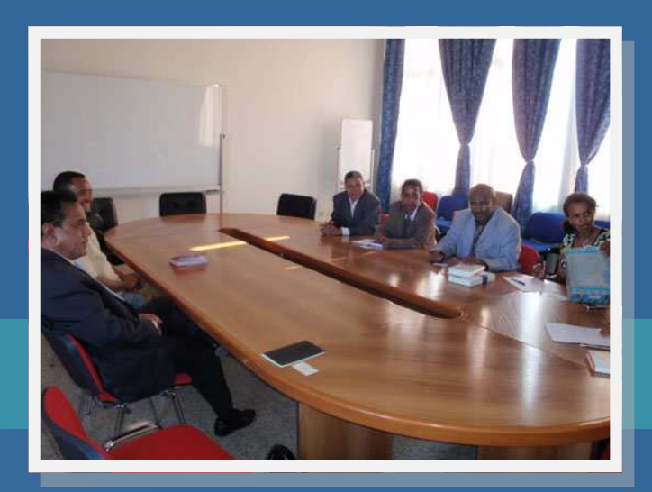
Photo: A senior EUCLID official assessing educational satisfaction during an official visit at a EUCLID Participating State Ministry of Foreign Affairs.